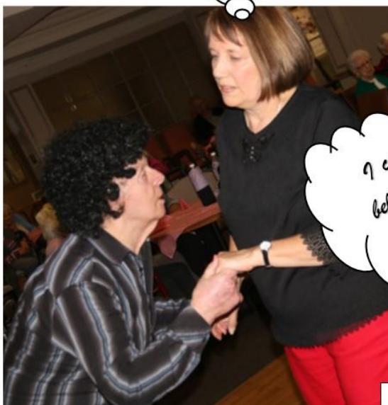
The independent side!