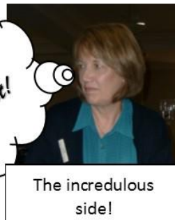
The incredulous side!