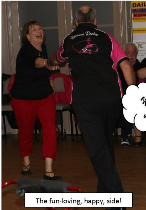
The fun-loving, happy, side!

Over the years we've seen many sides to Sue.