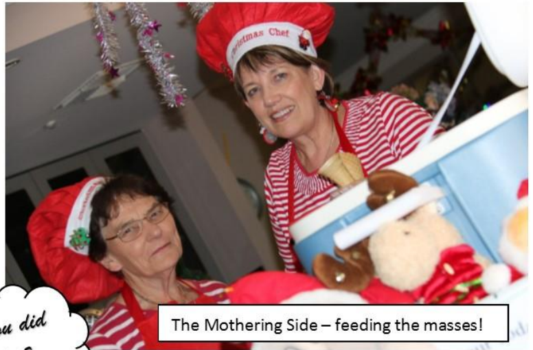
The Mothering Side – feeding the masses!