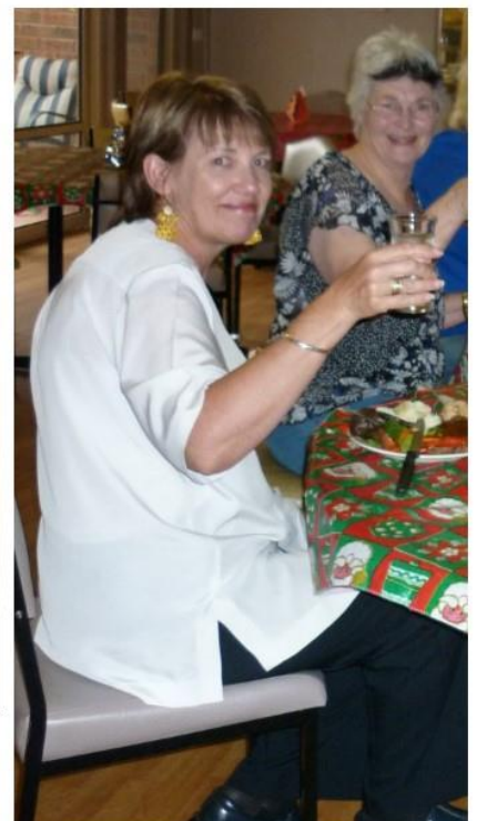
The fun-loving and sociable side!