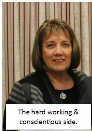
The hard working & conscientious side.